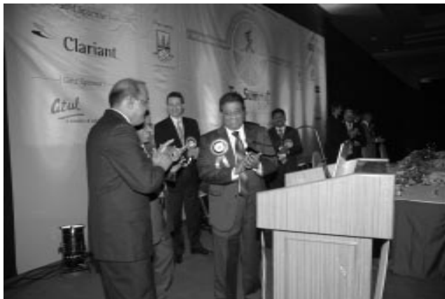
Inauguration of the TexSummit 2007 electronically.

coming from different textile clusters all over the country. They were the ones who shoulder the responsibility of processing of Textile and Apparels for their respective units and these executives and decision makers came right