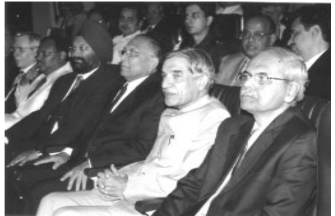
A view of audience.

He said while textile industries in the US and the European Union are recording negative growth, the Asian countries are growing rapidly. Among those countries turning out mass textile production, China has proved a formidable competitor for India.