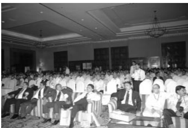
View of the Audience participating in Q & A Session.